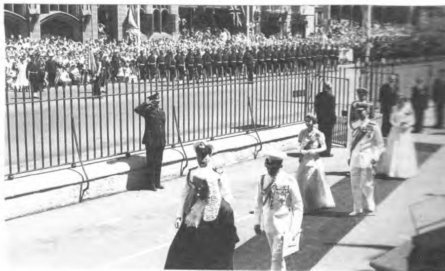
Her Majesty Queen Elizabeth II on her way to open the N.S.W. Parliament in 1954.

Over the years the Pioneers have had a lot of contact with the Royal Family starting in 1882. Many request for a Royal Grant for the Telegraph Station and the land it stands on, which finally was successful. Sending condolences when Queen Victoria died, congratulations at various Regal events etc. Looking back over our old records we were very pro the Monarchy. Despite great depressions, two world wars the Pioneers have survived, prospered and lived the good life. History will I believe remember Queen Elizabeth II reign as very, very good years and I believe we have enjoyed the best of them.