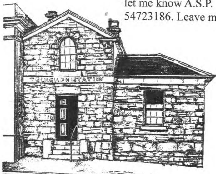
Pioneers and Old Residents' Association 208 Barker Street, Castlemaine 3450

If you are going please let me know A.S.P. 54723186. Leave message.