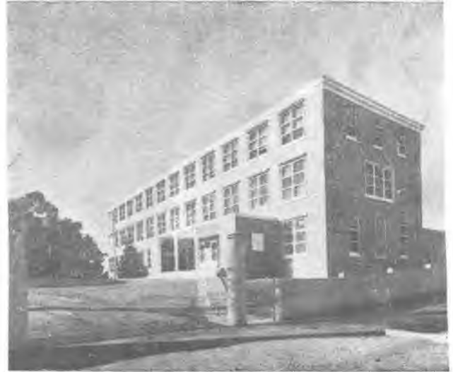
CASTLEMAINE DISTRICT COMMUNITY HOSPITAL