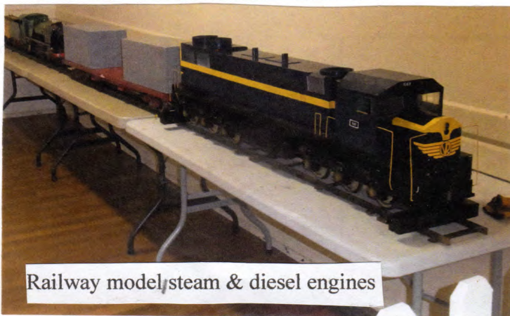
Railway model steam & diesel engines

Pioneers and Old Residents' Association 208 Barker Street, Castlemaine 3450