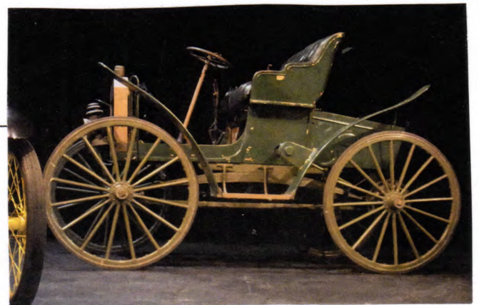
1909 Shacht early car.