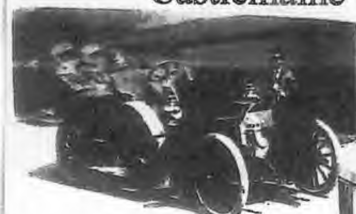
Old cars & trucks

Cars, veteran, vintage, classic modern, electric.