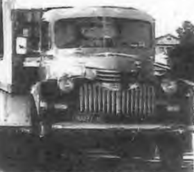
Steam (train, Paddle steamer)