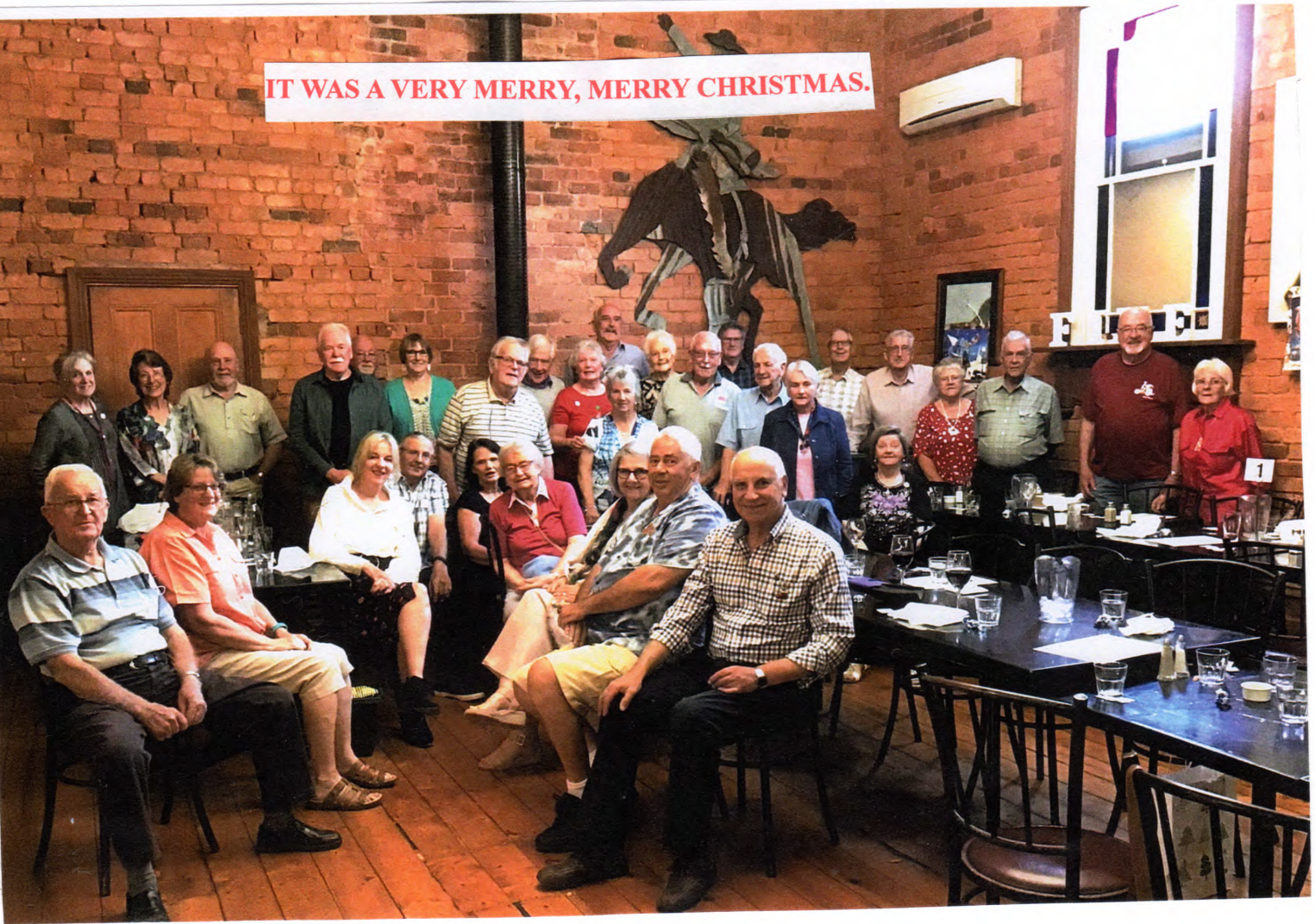
LAZING AROUND AT TARADALE