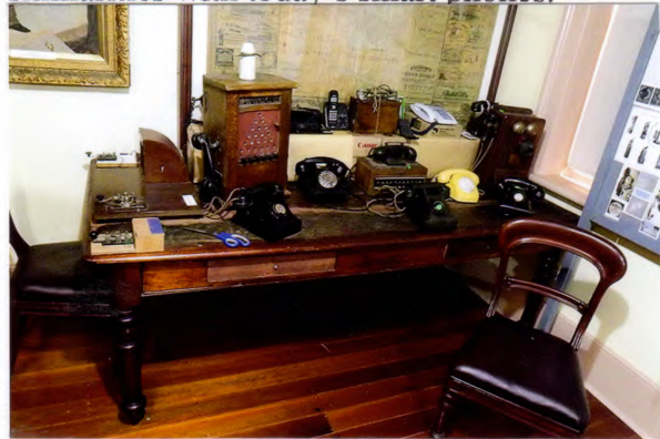
Our own Gower Bell

People seemed to remember it fondly, as they did the old party line. The working morse code keys entertained both kids and dads in equal proportions. The very early mobile phones made an impact on some of the older people, while the younger ones could see no similarities with today's smart phones.