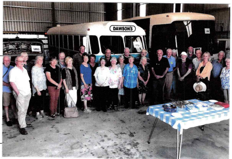
The Magnificent Dawson's Shed

Pioneers and Old Residents' Association 208 Barker Street, Castlemaine 3450