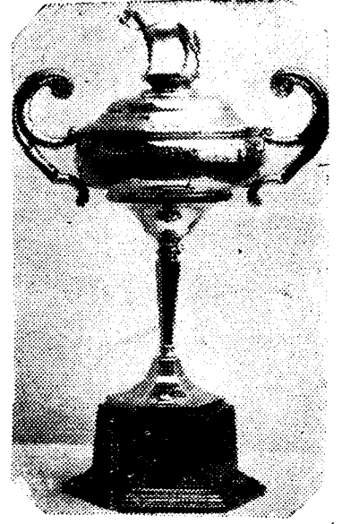
Wattle Gully Gold Cup, several of which were presented by the society at various shows. The cups were donated in the early years of the society by Wattle Gully Gold Mines.